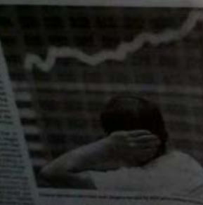
The man in the photo is the CEO of the company that was suspended from the New York Stock Exchange.

The SEC's oversight has led to the suspension of several Chinese I.P.O.s. The SEC's oversight has led to the suspension of several Chinese I.P.O.s.