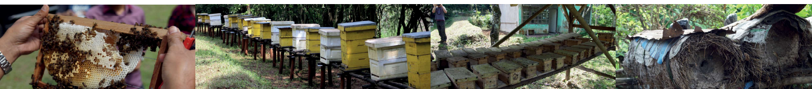
Figure 3-6. Various local types of beehives in Ethiopia and Indonesia

Advisory Boards in Ethiopia, Indonesia and the EU support the SAMS project with their expertise