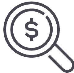
KYC / Bank Account