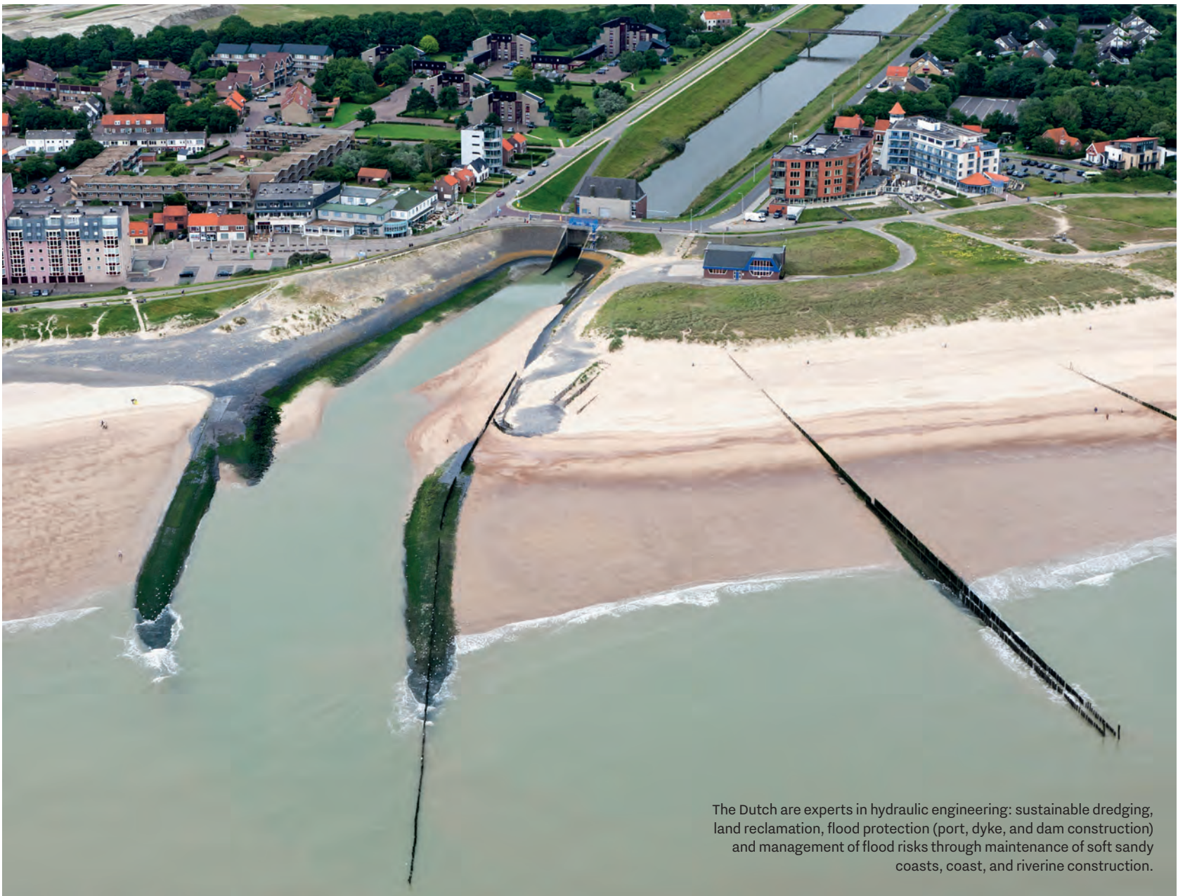
The Dutch are experts in hydraulic engineering: sustainable dredging, land reclamation, flood protection (port, dyke, and dam construction) and management of flood risks through maintenance of soft sandy coasts, coast, and riverine construction.