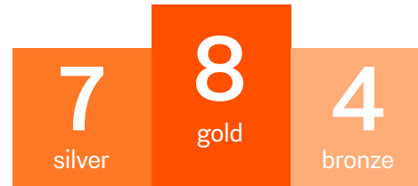
# Olympic medals Summer Olympics Rio de Janeiro 2016

Sport and physical activity have become prominent tools in governmental health policy in the Netherlands. The sports mission of the Ministry of Health, Welfare and Sport is to make it possible for everyone to play sports. Sport promotes health, provides social contacts and contributes to self-development. In addition, the Ministry focuses on, and funds top level sports, so that the Netherlands can perform well at international tournaments.