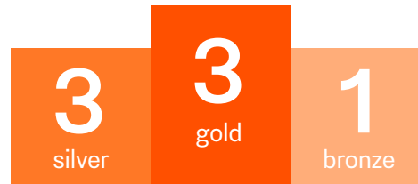
# Olympic medals Winter Paralympics PyeongChang 2018