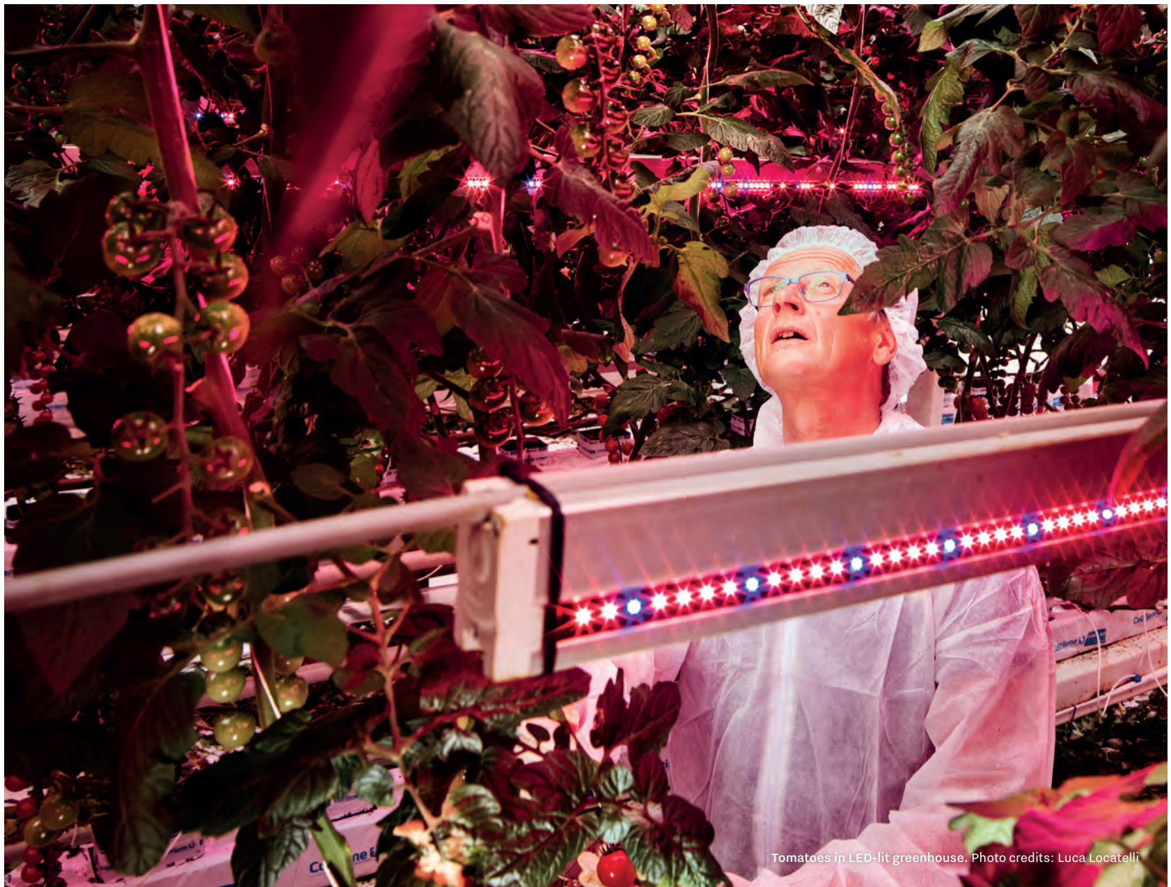
Tomatoes in LED-lit greenhouse.