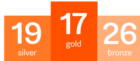
# Olympic medals Summer Paralympics Rio de Janeiro 2016