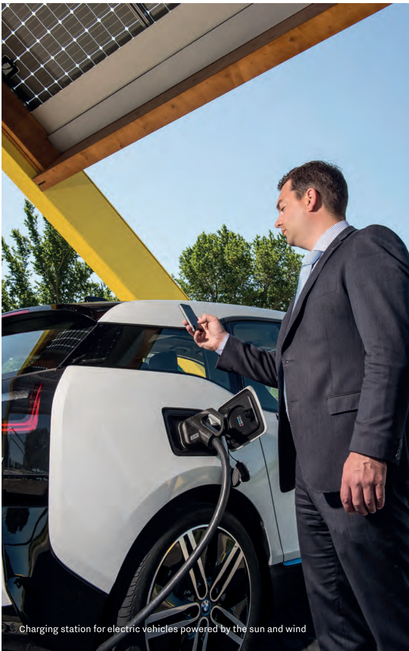
Charging station for electric vehicles powered by the sun and wind