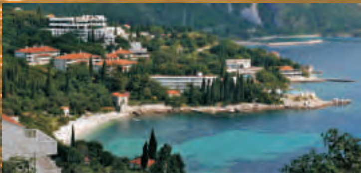
Tourist apartments Vile Plat *** Hotel Orphee***