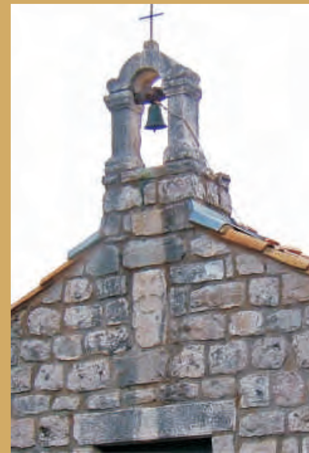
Church of Saint George (Sv. Đurđe) in Bujići