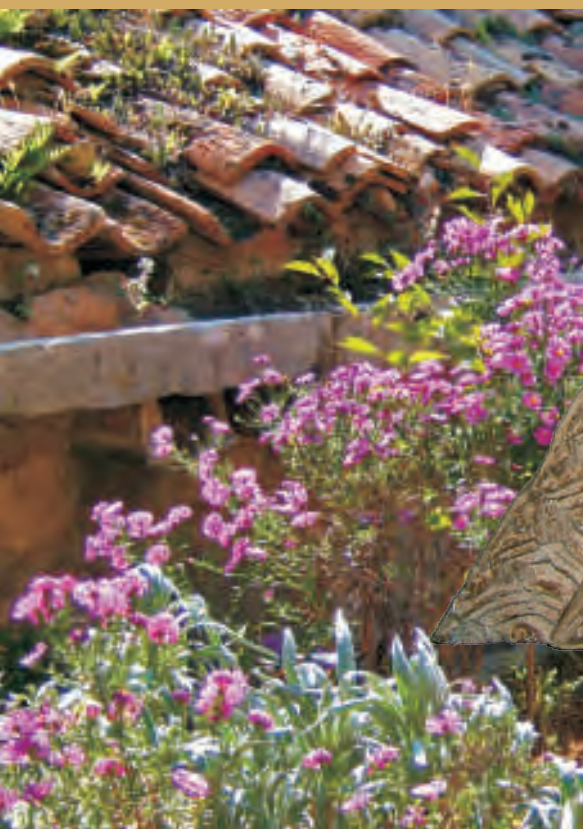
The pediment of the altar with braid ornaments, 10th/11th century, from the Dominican monastery in Čelopeci