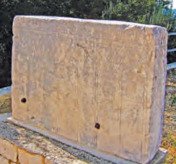
Luxurious decorative composition of a standing tomb-stone in Plat