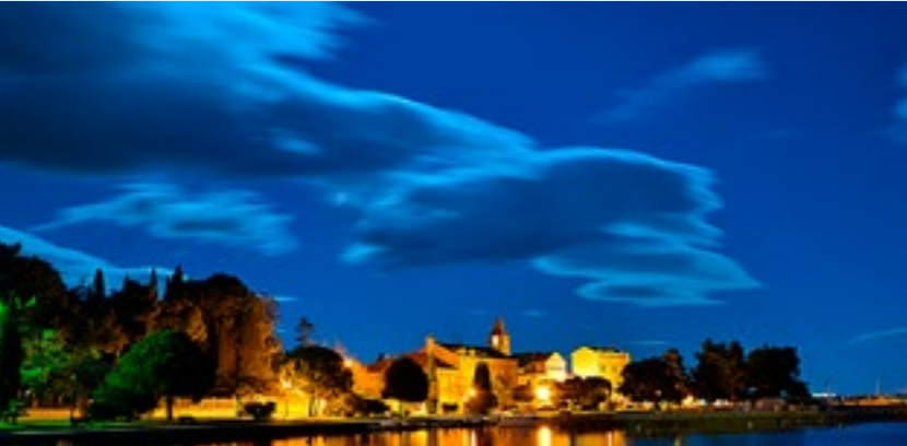
SV. FILIP I JAKOV