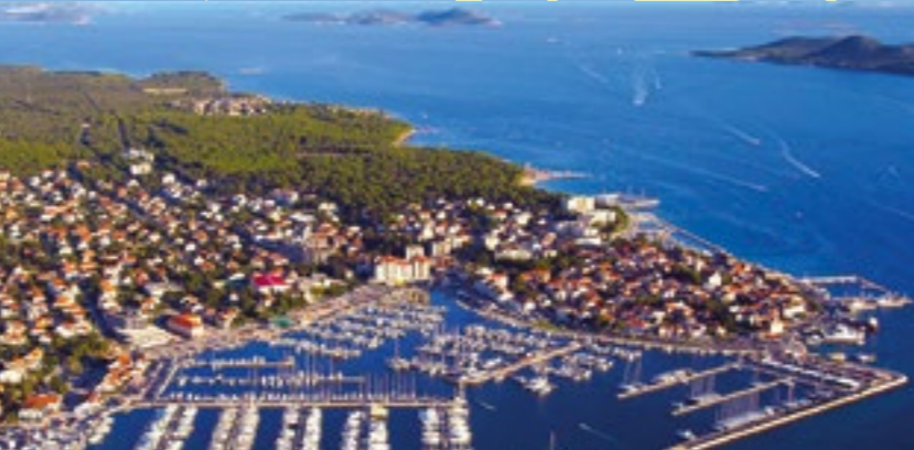
BIOGRAD NA MORU