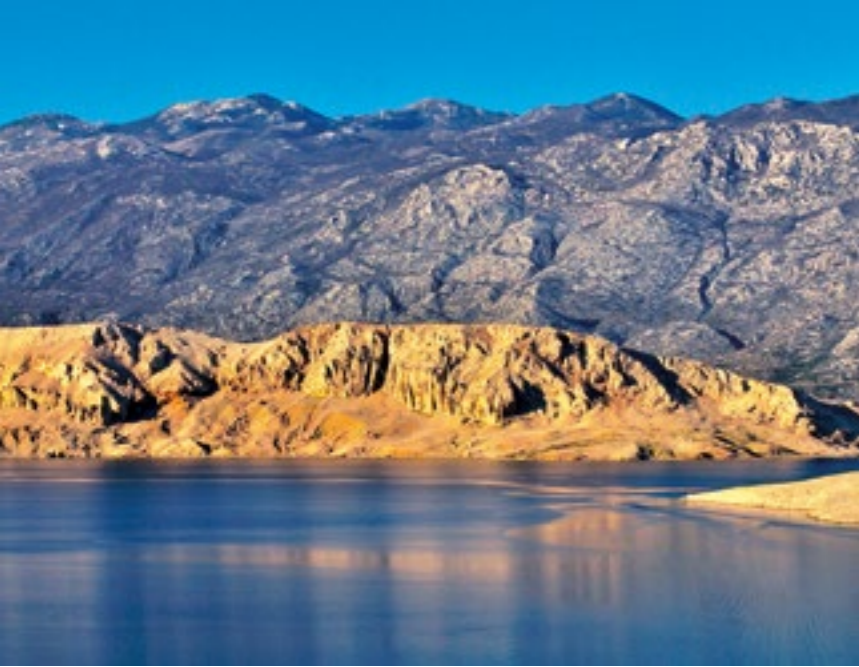
FORTICA - PAG