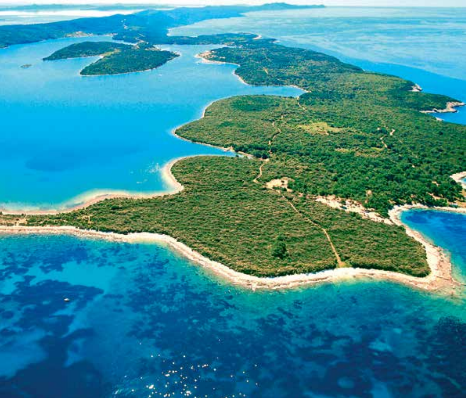
PANTERA, DUGI OTOK ISLAND